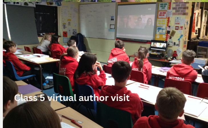
Class 5 virtual author visit