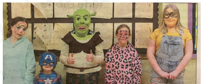
Class winners of North Duffield Primary School's best dressed competition for the brightest and funniest outfits. The school also

Thank you for your support with our most recent charity fundraising. We raised £251 for Comic Relief from our bake sale, fashion show and colourful outfits. Some of our children even made the local press with their fabulous outfits! Thank you also to the children in our School Council for their creative ideas and organisation.