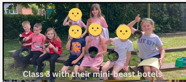
Class 3 with their mini-beast hotels